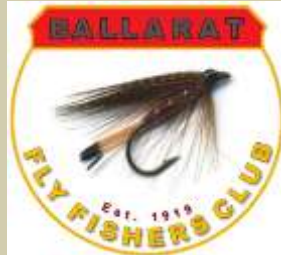
Ballarat Fly Fishers Club