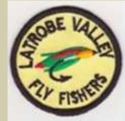
Latrobe Valley Fly Fishers