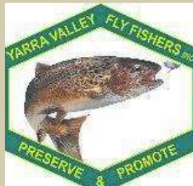
Yarra Valley Fly Fishers