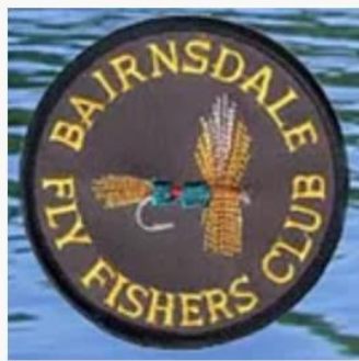
Bairnsdale Fly Fishers Club

We are especially grateful for the help and support of following clubs.